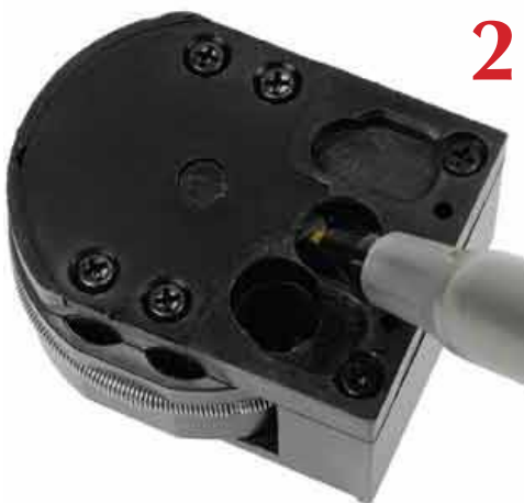
Image 2: Using the tip of a ballpoint pen, push the tab up to unlock the circular clip. The spring will rotate the clip to the next hole. Repeat until the tab no longer shows. The mag is now unwound.