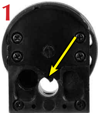
Image 1: When you load your magazine, the center hole may have a small black tab hanging down into the hole (arrow). If it does, go to step 2.

(As the rifle fires, the mag unwinds clockwise, bringing the next pellet in line with the bolt.)