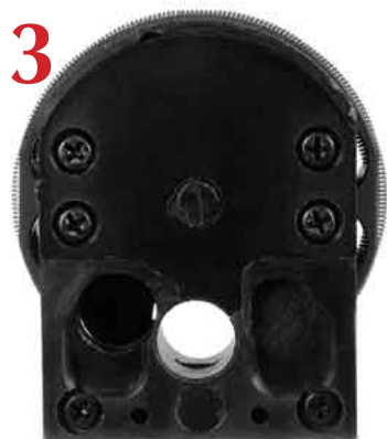
Image 3: This shows the magazine with the spring completely at rest. Notice that the tab does not show.