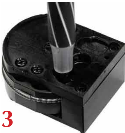
Image 3: Press the tip of a ballpoint pen into pellet's skirt to properly seat it.