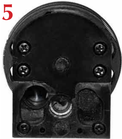
Image 5: After seating pellet, turn mag so pellet appears in center hole and left hole is ready to accept another pellet. Repeat steps 1-5 until mag is filled.

.177-cal. mags are 10mm deep .22-cal. mags are 10mm deep .25-cal. mags are 10mm deep 9mm mags are 11mm deep